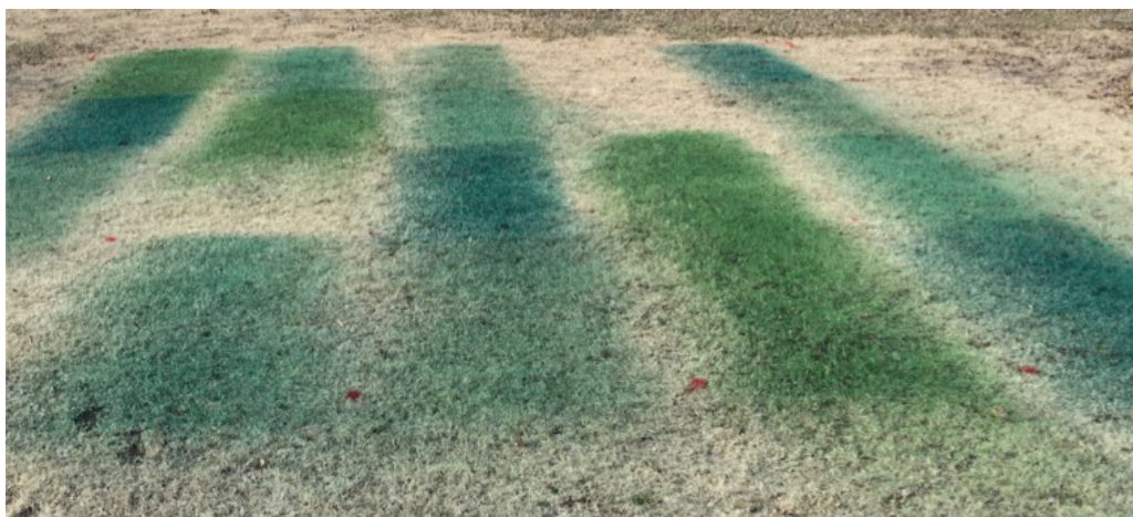
Figure 1. Dormant colorant field trial plots located at Rocky Ford Turfgrass Research Center in Manhattan, KS.

Results. Envy (turfgrass pigment) resulted in the highest blemished clothing percentage (60%). All other treatments were no different than the non-treated (Figure 2). Results demonstrate that the tested turfgrass paints safely adhere to the turfgrass canopy and do not blemish athletic clothing.